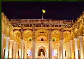
THIRUMALAI NAYAKKAR PALACE